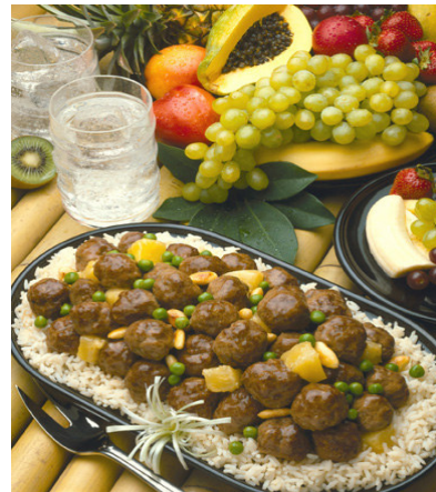
Your vegetarian dishes come alive with tasty, Organic HealthiLifer Powdered Mushroom.

Many of the poisons dissolve only in oil and are therefore concentrated in the fatty tissues of all animals and fish. And as you know, it is the fat that gives taste to dairy, meats, poultry, and fish. Therefore, when you eat dairy, meat, poultry, or fish, you take large quantities of these poisons into the fatty tissues of your own body. And from there, they wreak havoc.